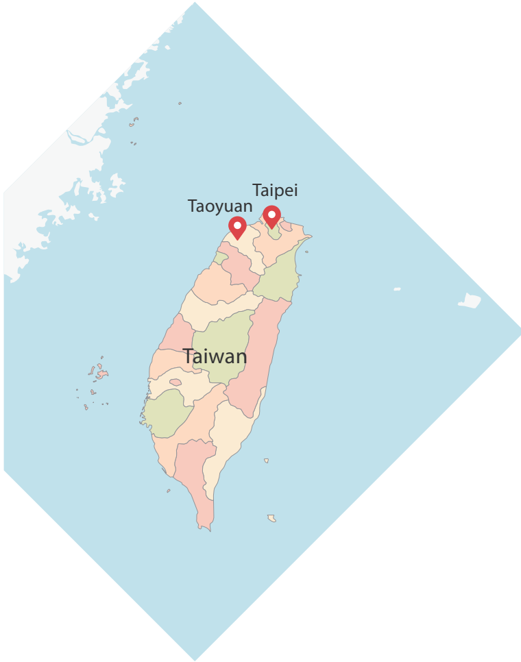
Taiwan with Counties-Multicolor by FreeVectorMaps.com